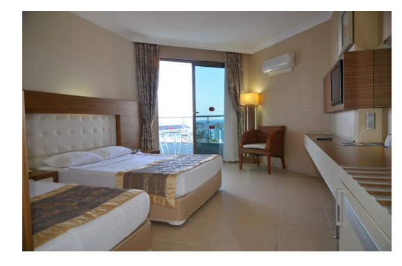
MAINBUILDING FAM. ROOM