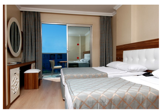
ANEX BUILDING FAM. ROOM