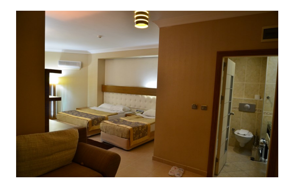
ANEX BUILDING STANDART DBL ROOM